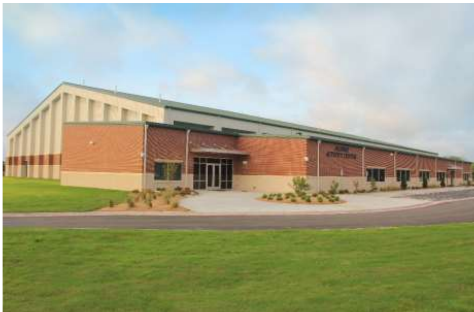
Midway Activity Center (located behind MHS)